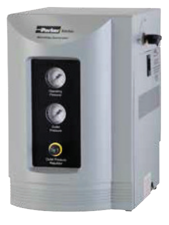
NitroVap-1LV and NitroVap-2LV

Since NitroVap generators incorporate unique membrane separation technology, nitrogen delivery is immediate to the sample concentrator. "Lock-it-and-leave-it" operation of the sample concentrator is maintained without downtime and without "running out of gas" mid blow-down.