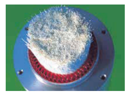
This Technology Features Advanced HiFluxx Fiber